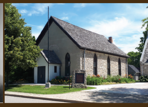
Nazrey A.M.E. Church: Built in 1848, the church was a terminus for the Underground Railroad.